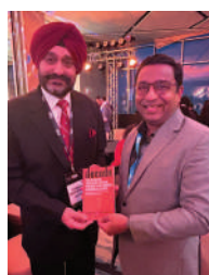
General Bikram Singh Former Army Chief of India